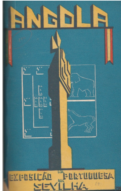
Figure 1: Cover of the guide to Angola published to accompany the colony's section at the 1929 Ibero-American Exposition of Seville: Angola: breve monografia histórica, geográfica e económica elaborada para a Exposição Portuguesa em Sevilha . Luanda: Empresa Gráfica De Angola, 1929.