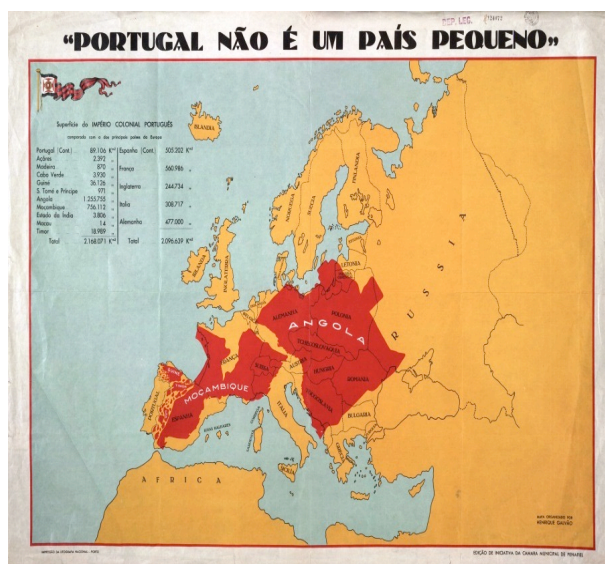
Figure 5: “Portugal não é um país pequeno”: image created by Henrique Galvão on the occasion of the Exposição Colonial Portuguesa (1934).