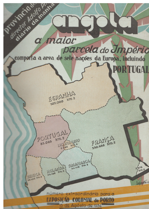
Figure 4: Cover of the special magazine edition of A província de Angola . Número Extraordinário dedicado á Exposição Colonial Portuguesa e em honra da Restauração de Angola em 15 de Agosto de 1648 , special issue of A província de Angola ([Luanda] 15 Aug. 1934).