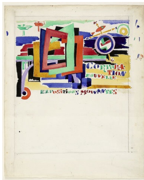
Figure 2: Amadeo de Sousa Cardoso, Study for "Expositions Mouvantes – Corporation Nouvelle" 1915 (Fundação Calouste Gulbenkian, Centro de Arte Moderna, 77DP343).