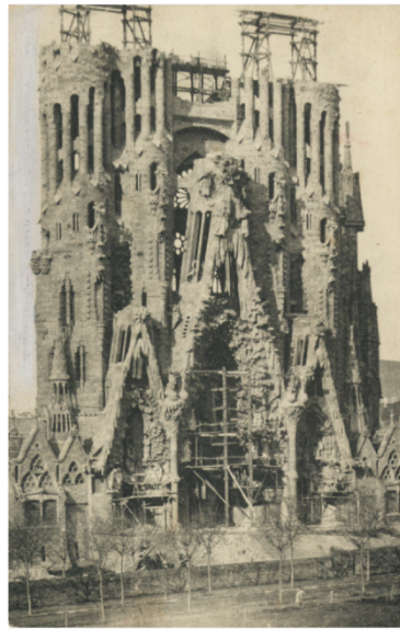
Figure 1: Postcard from Mário de Sá-Carneiro to Fernando Pessoa Barcelona, September 6, 1914 (Sá - Carneiro, 2015: 279)

From Barcelona, he would then travel to Madrid and finally on to Lisbon, where he would arrive on 9 September. 6