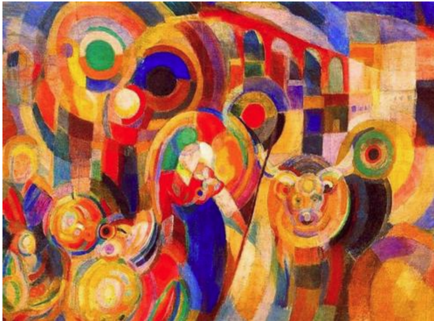
Figure 5: Sonia Delaunay, Marché au Minho , 1915 [ https:// www.wikiart.org/en/sonia-delaunay/market-at-minho ]

encountered in the markets, capturing the colors and movement of those spaces in works like Marché au Minho (1916).