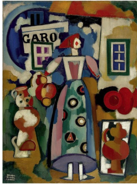
Figure 3: Amadeo de Sousa Cardoso, Canção Popular – A Russa e o Figaro , c. 1916 (Fundação Calouste Gulbenkian, Centro de Arte Moderna, 77P18)